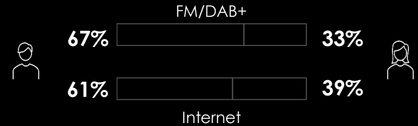
CIM RAM, North, profile (on time spent), Klara, May'23-Apr'24, Mon-Sun, 6-22u