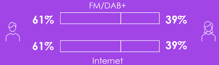
CIM RAM, Belgium North, profile (on time spent), Studio Brussel, May'23-Apr'24, Mon-Sun, 6-22h