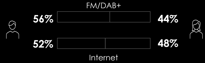
CIM RAM, North, profile (on time spent), Klara, Jan-Dec 2024, Mon-Sun, 6-22u